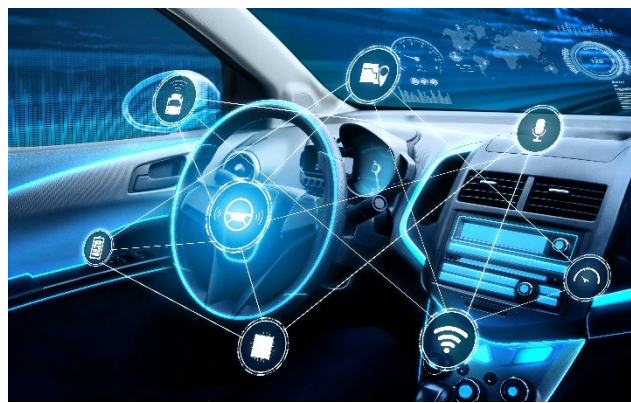
Image 2: ADTF is the comprehensive software framework for the development and testing of ADAS Functions up to autonomous systems.