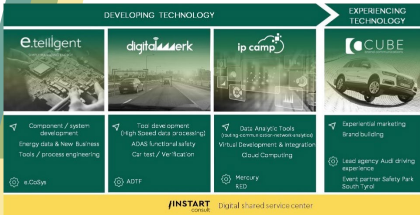
Image 1: The INSTART group consists of five highly specialized companies.