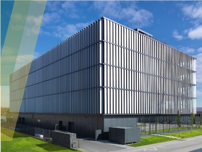
Image 1: The Headquarter of the INSTART group in Ingolstadt